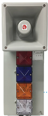
FA324 Alarm Bar